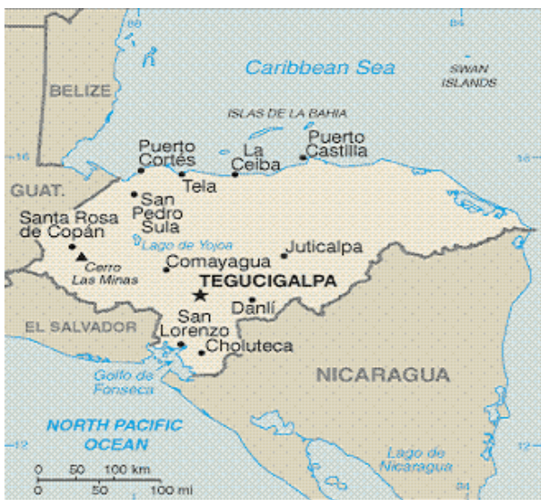
Figure 6. Map of the Republic of Honduras.

The Republic of Honduras gained its independence from Spain in 1821. It has an area of 112,090Km 2 and its map is presented in Figure 6. The first Muslims came from Syria, Lebanon and Palestine. By 1910, there were only ten Muslims in the country. The 1945 census indicated that the Muslim population consisted of 28 individuals or 0.00% of the total population. Later estimates increased the number to 100 or 0.00% in 1974, to 1,000 or 0.02% in 2001, to 2,000 or 0.02% in 2011. Thus, assuming that the percentage of Muslims will increase by 0.01 of a percentage point per decade; then the Muslim population is expected to reach 3,000 or 0.03% in 2020, then 8,000 or 0.06% by 2050, and 15,000 or 0.11% by 2100. A summary of the data is provided in Table 5.