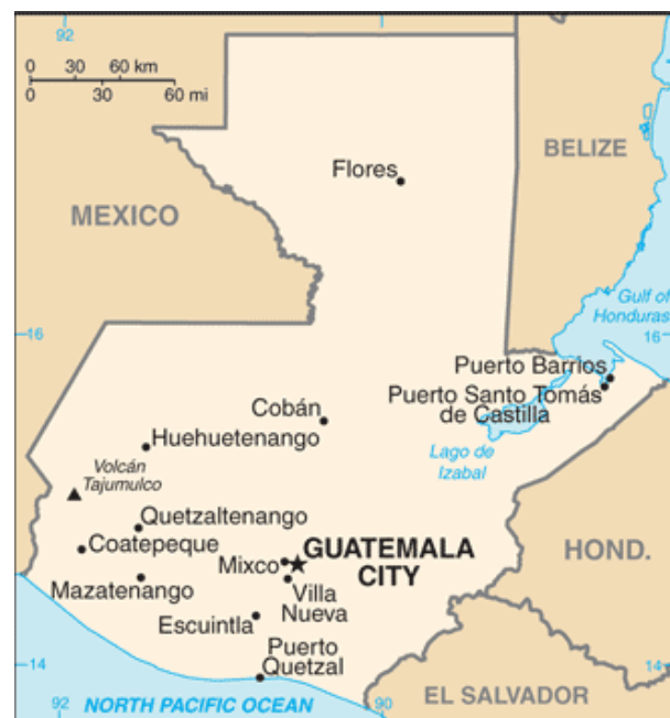
Figure 5. Map of the Republic of Guatemala.

The Republic of Guatemala gained its independence from Spain in 1821. It has an area of 108,889Km 2 and its map is presented in Figure 5. The first Muslims came from Palestine. As shown in Table 4, estimates for the Muslim population increased from twenty in 1914, to 200 in 1973, to 1,000 or 0.01% in 1994, to 1,200 or 0.01% in 2002. Thus, assuming that the percentage of Muslims will increase by 0.01 of a percentage point every other decade; then the Muslim population is expected to reach 4,000 or 0.02% in 2020, then 9,000 or 0.03% by 2050, and 28,000 or 0.06% by 2100.