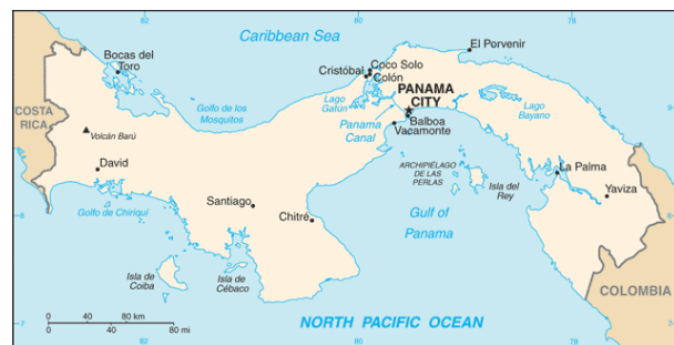
Figure 9. Map of the Republic of Panama.

The Republic of Panama gained its independence from Columbia in 1903. It has an area of 75,420Km 2 and its map is presented in Figure 9. The first Muslims in Panama were Chinese workers who were brought for building the Panama Canal between 1904 and 1914. They were then followed by Palestinians after the middle of the twentieth century. Thus, estimates for the Muslim population increased none in 1904, to twenty of 0.01% in 1911, to 500 or 0.04% in 1970, to 1,000 or 0.05% in 1980, to 5,000 or 0.18% in 2000, to 10,000 or 0.29% in 2010. Thus, assuming that the percentage of Muslims will increase by 0.05 of a percentage point per decade; then the Muslim population is expected to reach 14,000 or 0.4% in 2020, then 26,000 or 0.5% by 2050, and 39,000 or 0.8% by 2100. The data are summarized in Table 8.