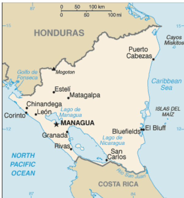
Figure 8. Map of the Republic of Nicaragua.

The Republic of Nicaragua gained its independence from Spain in 1821. It has an area of 130,370Km 2 and its map is presented in Figure 8. The first Muslims came from Palestine. Estimates of Muslims increased from ten in 1906, to 150 or 0.01% in 1971, to 500 or 0.01% in 1995. According to the 2005 census, the Muslim population increased to 321 or 0.01%. Thus, assuming that the percentage of Muslims will increase by 0.01 of a percentage point per decade; then the Muslim population is expected to reach 1,400 or 0.02% in 2020, then 4,000 or 0.05% by 2050, and 7,300 or 0.10% by 2100. The data are summarized in Table 7.