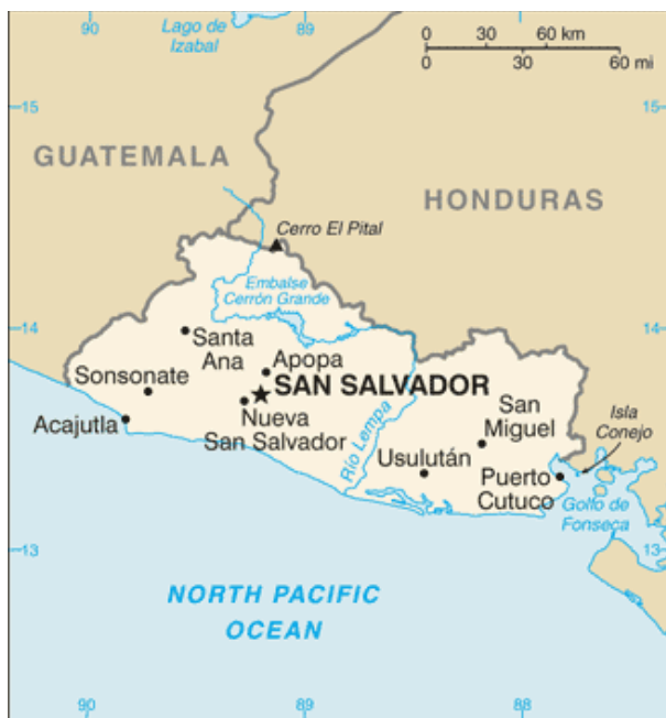
Figure 4. Map of the Republic of El Salvador.

The Republic of El Salvador gained its independence from Spain in 1821. It has an area of 21,041Km 2 and its map is presented in Figure 4. The first Muslims came from Palestine. As shown in Table 3, estimates for the Muslim population increased from none in 1908, to 100 in 1971, to 500 or 0.01% in 1992, to 1,300 or 0.02% in 2007. Thus, assuming that the percentage of Muslims will increase by 0.01 of a percentage point per decade; then the Muslim population is expected to reach 2,000 or 0.03% in 2020, then 4,600 or 0.06% by 2050, and 7,500 or 0.11% by 2100.