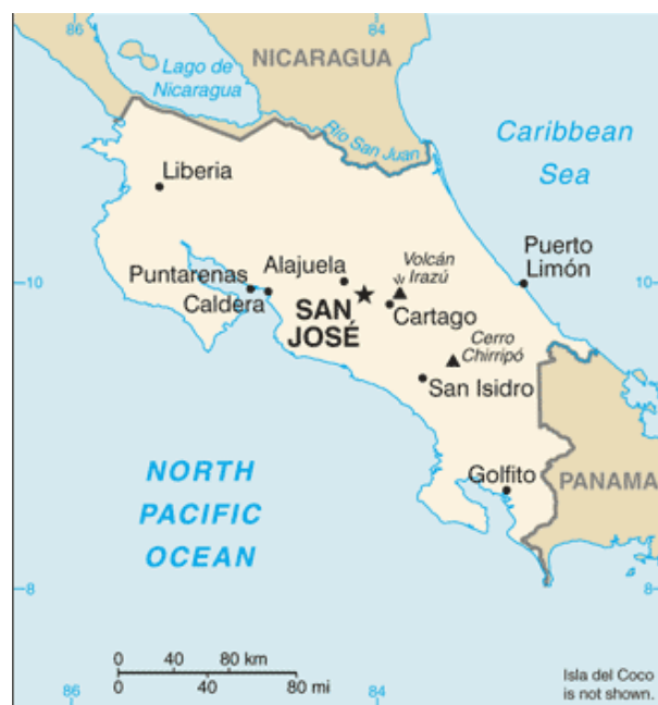
Figure 3. Map of the Republic of Costa Rica.

The Republic of Costa Rica gained its independence from Spain in 1821. It has an area of 51,100 Km 2 and its map is presented in Figure 3. First Muslims came from Palestine in early twentieth century. As shown in Table 2, estimates for the Muslim population increased from none in 1908, to 100 or 0.01% in 1973, to 500 or 0.01% in 2000 or 2011, but remain at 0.01% of the total population since 1970s. Thus, assuming that the percentage of Muslims will increase by 0.01 of a percentage points per decade, then the Muslim population is expected to reach 1,100 or 0.02% in 2020, then 3,000 or 0.05% by 2050, and 5,000 or 0.10% by 2100.