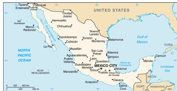
Figure 7. Map of the United Mexican States.

The United Mexican States gained its independence from Spain in 1821. It has an area of 1,964,375Km 2 and its map is presented in Figure 7. Towards the end of the nineteenth century Muslims emigrated from Syria. Based on census data as shown in Table 6, the Muslim population increased from 162 in 1895, to 602 in 1910, to 1,421 in 2000, to 3,760 in 2010, but still constitutes 0.00% of the Mexican population. Thus, assuming that the percentage of Muslims will increase by 0.01 of a percentage point every half century; then the Muslim population is expected to reach 13,000 or 0.01% in 2020, then 14,000 or 0.01% by 2050, and 25,000 or 0.02% by 2100.