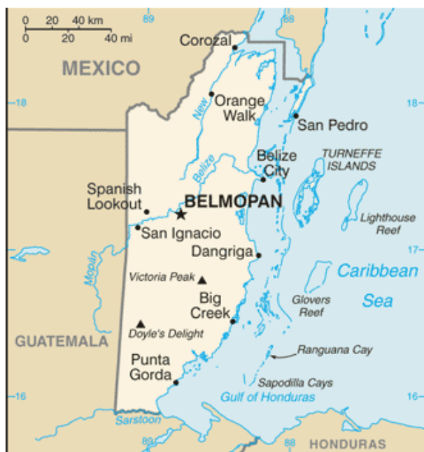
Figure 2. Map of Belize.

It gained its independence from the UK in 1981 when it also changed its name from British Honduras. It has an area of 22,966 Km 2 and its map is presented in Figure 2. In 1911, the Muslim population consisted of twenty people or 0.05%, who arrived from the Ottoman Empire. According to census data as shown in Table 1, the Muslim population increased from 12 or 0.02% in 1946, to 110 or 0.08% in 1980, to 159 or 0.09% in 1991, to 243 or 0.10% in 2000, to 577 or 0.19% in 2010. Thus, assuming that the percentage of Muslims will increase by 0.05 of a percentage points per decade; then the Muslim population is expected to reach 1,000 or 0.3% in 2020, then 2,100 or 0.4% by 2050, and 3,600 or 0.7% by 2100.